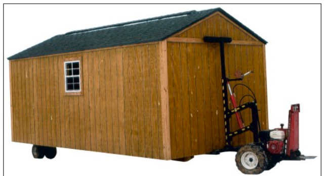
Mule: Available in most areas, used for tight areas and easier maneuvering