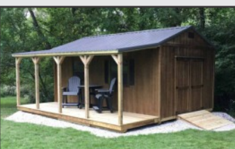
We can quote finished interior