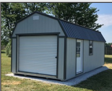
Includes one window, one entry door and one roll up door