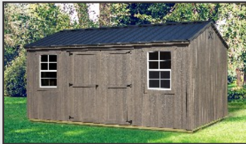
Includes two windows