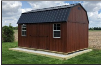
Includes two lofts and two windows