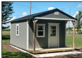
We can quote finished interior