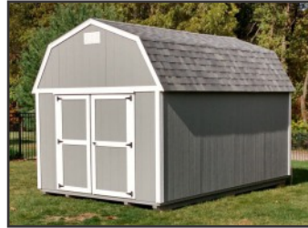
Includes two lofts