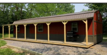
We can quote finished interior