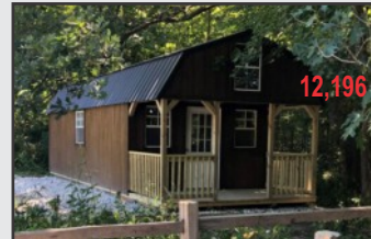
We can quote finished interior