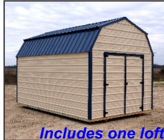
Includes one loft