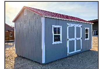
Includes 2 windows

12' Long and shorter - 4' single door 14' and longer - double doors