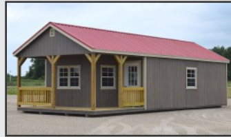
Can be finished out by customer