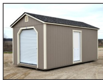
Includes garage roll up door, one man door and one window