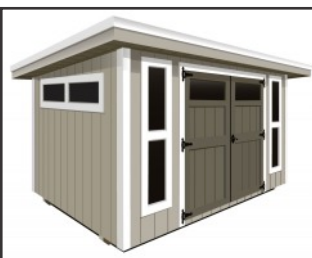
Includes (10) 35" transom windows / 6 on front, 2 on each side