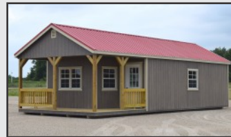
Can be finished out by customer