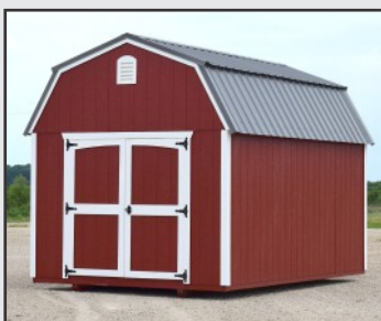
Includes one loft