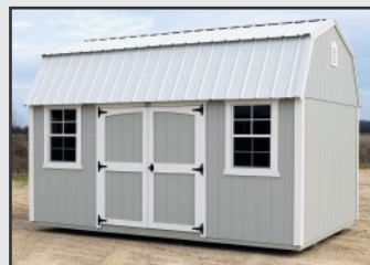
Includes two lofts and two windows

12' Long and shorter - 4' single door 14' and longer - double doors