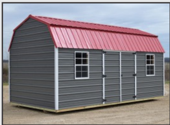
Includes two lofts and two windows

12' Long and shorter - 4' single door 14' and longer - double doors