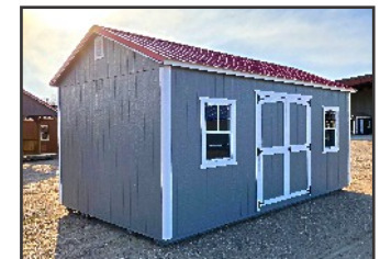
Includes 2 windows

12' Long and shorter - 4' single door 14' and longer - double doors