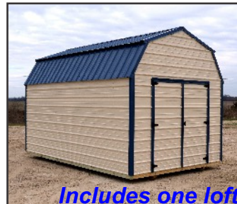
Includes one loft