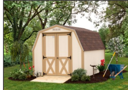
Low Wall Barn