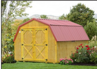
Low Wall Barn