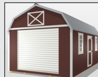
Includes: 8' Roll up door, 3' Entry door and 2 windows