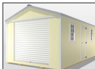
Includes: 8' Roll up door, 3' Entry door and 2 windows