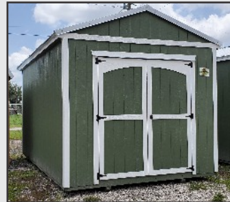
8' Wide - 4' Doors 10' & 12' Wide - 6' Doors