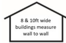
wall to wall