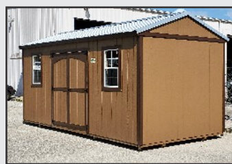
Includes: 6' Door and 2 Windows