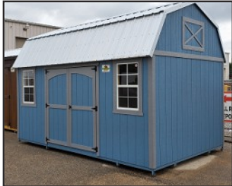
Includes: 6' Door and 2 Windows