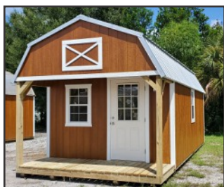
Includes: 9-Lite door and 3 Windows