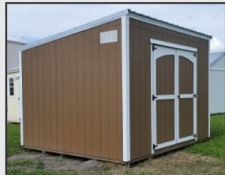
8' Wide - Single Door 10' & 12' Wide - Double Doors