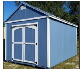
8' Wide - 4' Doors 10' & 12' Wide - 6' Doors