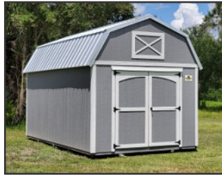
8' Wide - 4' Doors 10' & 12' Wide - 6' Doors