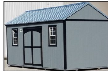
Includes: 6' Door and 2 Windows