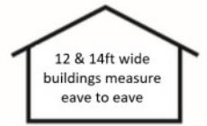
eave to eave

Please check to see if you need a building permit for your building