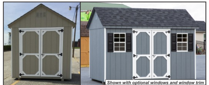
Shown with optional windows and window trim