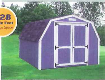
Barn (4ft. Sidewall)