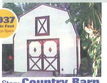
Two-Story Country Barn