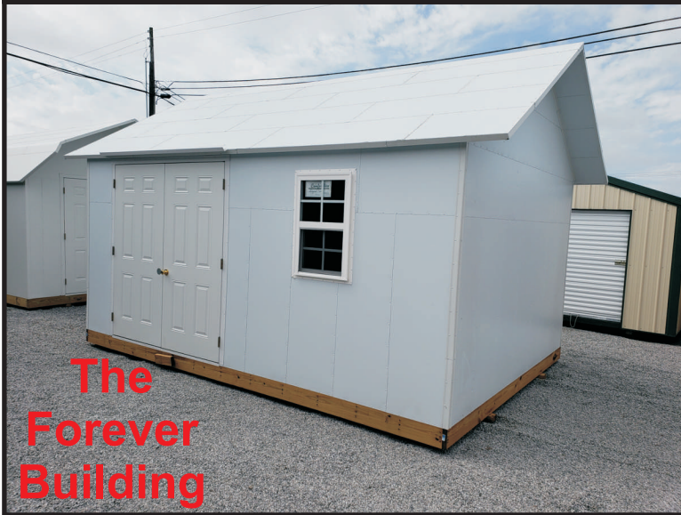
The Forever Building