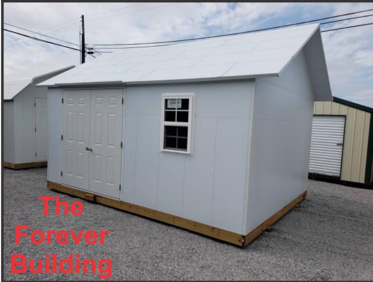
The Forever Building