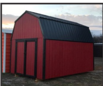
Price includes (1) 4' loft and 6x7 double doors