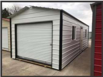
Price includes (1) 2x3 window, (1) 6-panel man door and (1) 6x7 roll up door