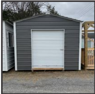
Price includes 6x7 Roll-up door