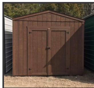
Price includes 6x7 double doors