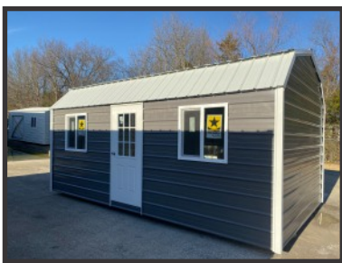
Price includes (2) windows and (2) 4' lofts