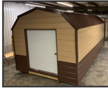
Price includes (1) 4' loft and 6x7 roll up door