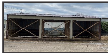
Shown with optional bays See available options on back side