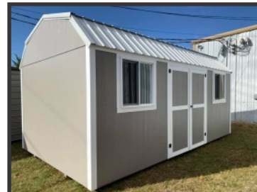
Price includes (2) windows, (2) 4' lofts and 6x7 double doors