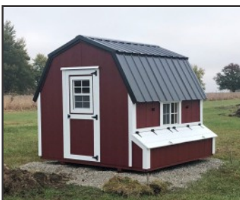
Includes roosting bar, nesting box, chicken door, windows and entry door