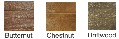
Butternut Chestnut Driftwood

Mahogany Honey Gold For urethane pricing, use T-1-11 pricing chart +10%