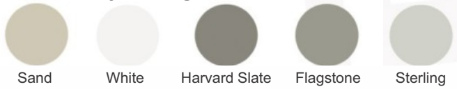
Sand White Harvard Slate Flagstone Sterling