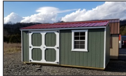
Garden Shed (1 window)