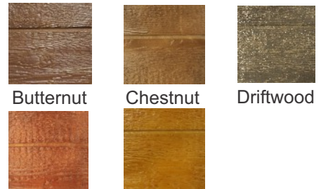
Butternut Chestnut Driftwood Mahogany Honey Gold