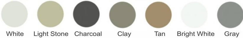
White Light Stone Charcoal Clay Tan Bright White Gray