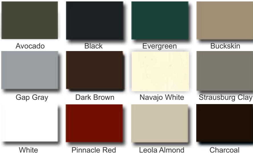
Avocado Black Evergreen Buckskin Gap Gray Dark Brown Navajo White Strausburg Clay White Pinnacle Red Leola Almond Charcoal