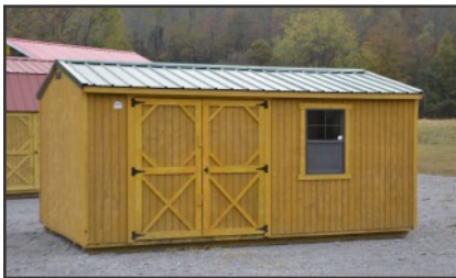
Garden Shed (1 window)