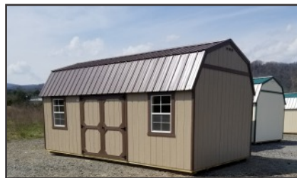
Side Lofted Barn (2 windows)