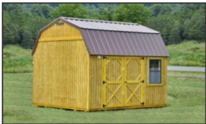
Side Lofted Barn (1 window)