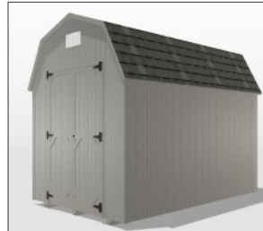
One paint color only Trim will be same color as body