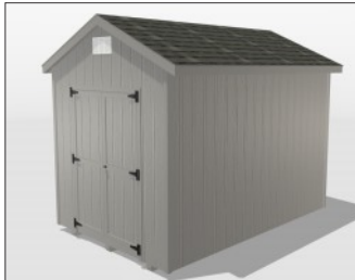
One paint color only Trim will be same color as body