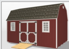
12' Long and smaller - 1 Window 16' Long and larger - 2 Windows