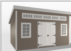
12' Long and smaller - 1 Window 16' Long and larger - 2 Windows