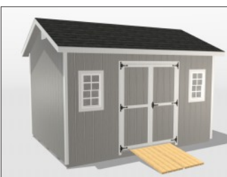
12' Long and smaller - 1 Window 16' Long and larger - 2 Windows