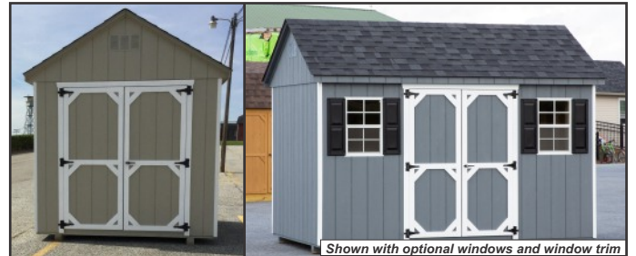
Shown with optional windows and window trim